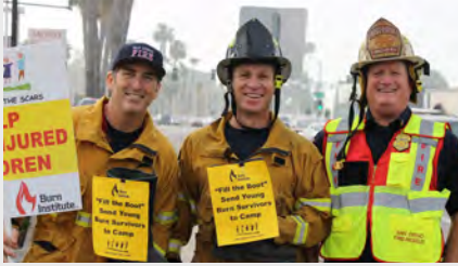
The Firefighter "Fill The Boot" Drive

All proceeds fund our programs and services. Thank you to our sponsors and volunteers for your support.