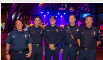
The "Bash" at The Belly Up