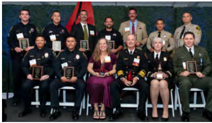
Spirit of Courage Awards Banquet