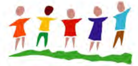
CAMP BEYOND THE SCARS