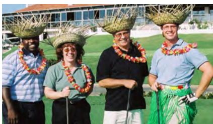
SD County Fire Chiefs Golf Classic

Firefighters put on a great show at the County Fair (33rd annual!) along with an informative Fire Safety Exposition.