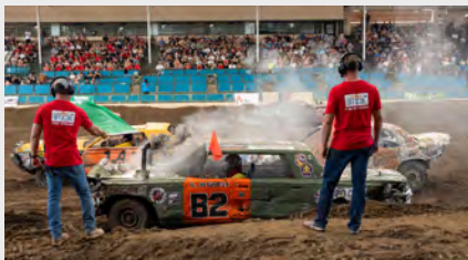
Firefighter Demolition Derby + Safety Expo